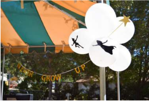
Neverland/ Peter Pan

Decorations, attractions, and menus can be customized to match your theme and make your event unique and unforgettable. Whether you choose one of our tried and true packages or want us to create something new and exciting, adding a theme is sure to enhance your event and wow your guests!