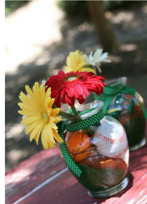
Game Day (Sports)